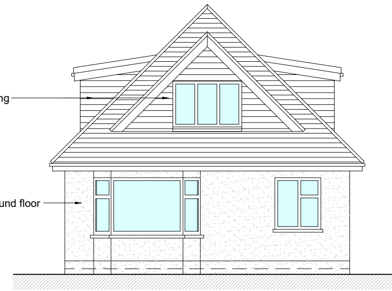
Front (North Western) Elevation