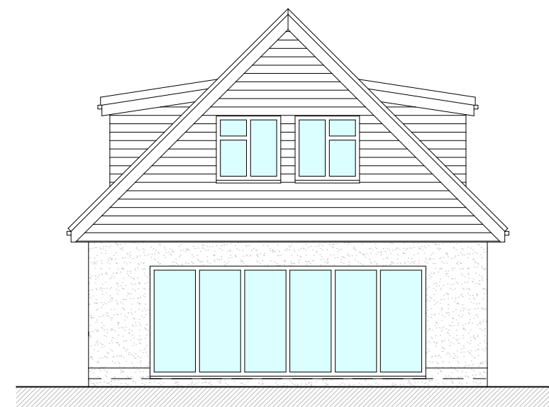
Rear (South Eastern) Elevation